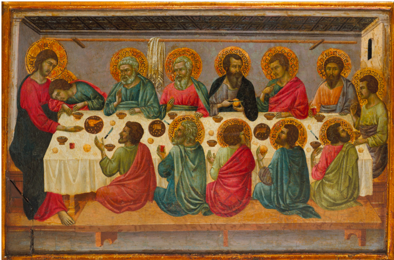
The Last Supper Ugolino da Siena (Ugolino di Nerio), ca. 1325–1330, Italian

Sortie in F Major Léon Boëllman (1862–1897)